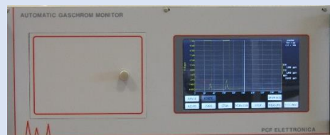
Mod. 529/NR/T Front Panel

The H ions bind to the oxygen in the air generating water, while the C ions that are formed as a result of the oxidation C_x = CO , are proportional to the concentration of hydrocarbons present; moving in an electrostatic field (anode and cathode) they are attracted to one of the polarities, triggering an ionic current proportional to the concentration of the sample.