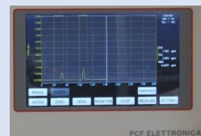
Video Display (details)